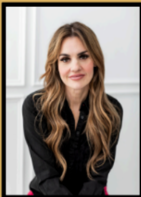
ABBY JOHNSON former Planned Parenthood Director turned Pro-Life Advocate

We are thrilled for the opportunity to host ABBY JOHNSON as our VIP speaker for our 2026 Annual Banquet. Abby is a former Planned Parenthood director whose change of heart led her to speak against abortion and become a best-selling author, CEO, and the true life story behind the major motion picture "Unplanned" – plus many other incredible accomplishments!